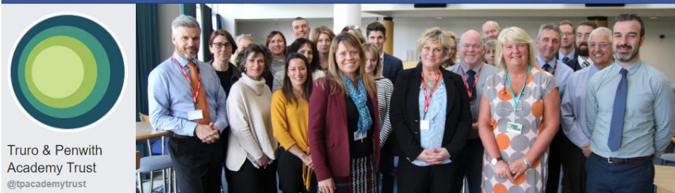
Truro & Penwith Academy Trust @tpacademytrust